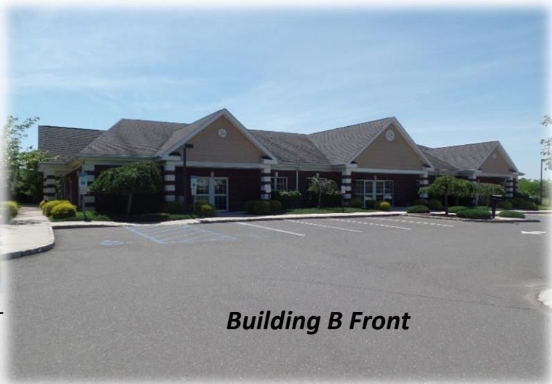
Building B Front