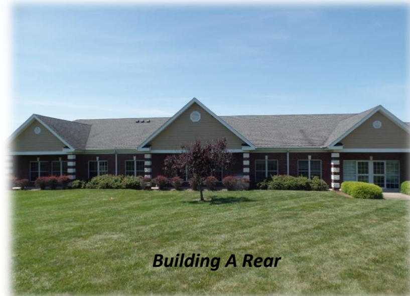
Building A Rear