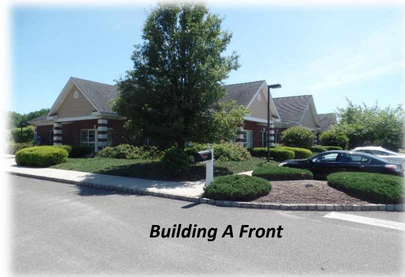
Building A Front