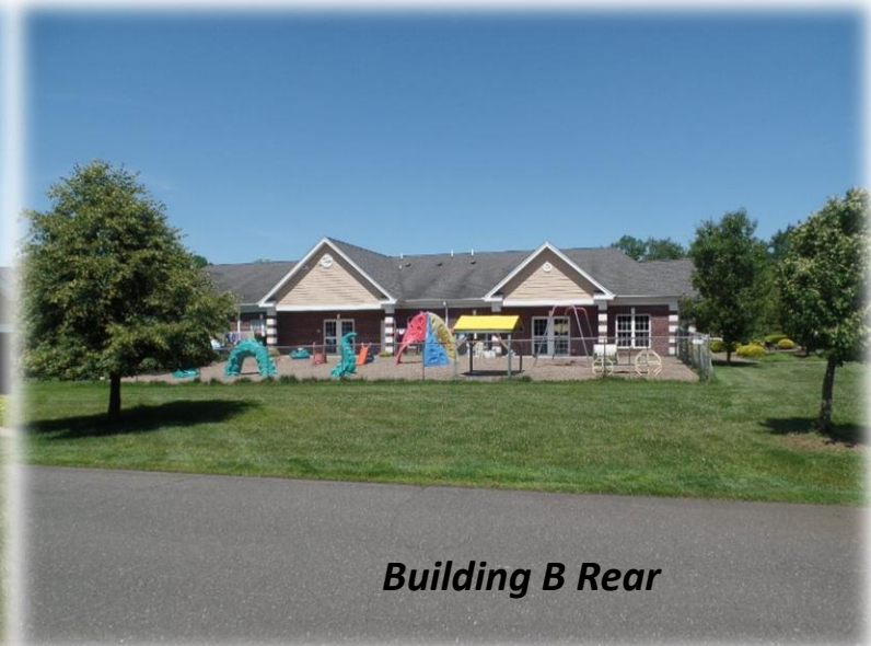
Building B Rear